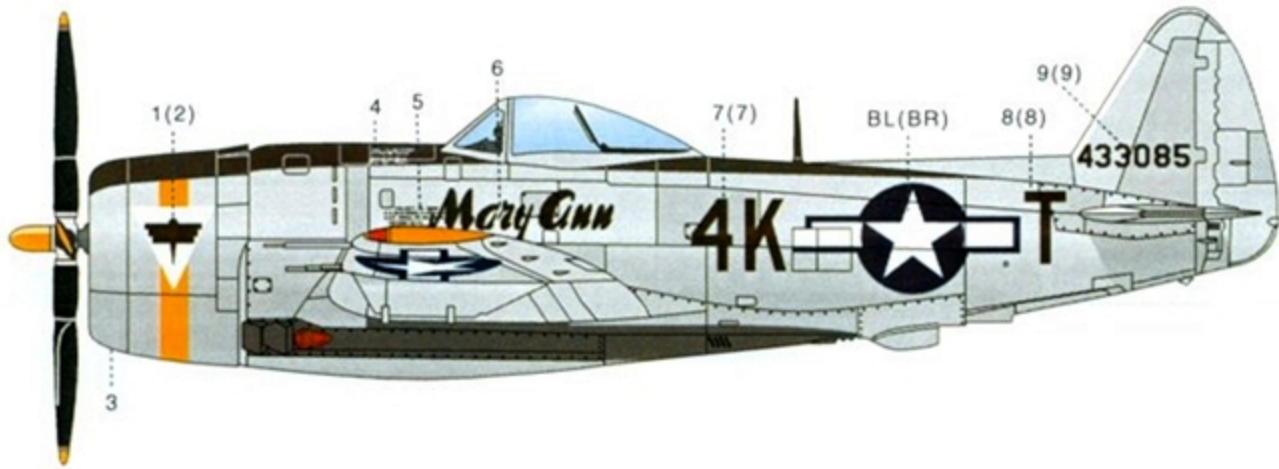
Aircraft 3 - P-47D-27-RE, 'Mary Ann' flown by Lt. Robert C. Meltvedt, 506FS, 404FG. Overall natural metal finish with Black antiglare panel. Prop hub Yellow. Black belly paint. C.E. Symmetrical paddle blade propeller.