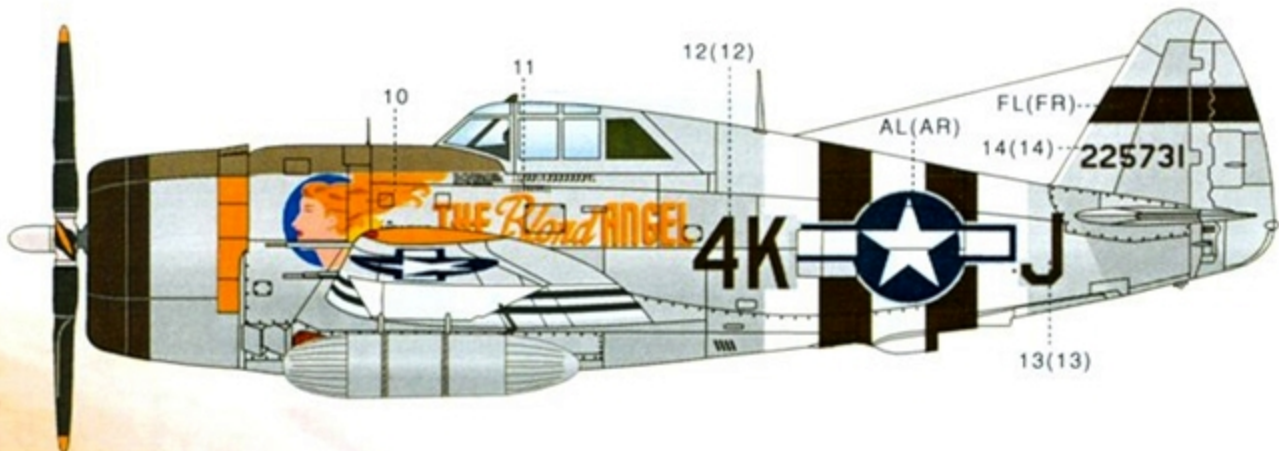
Aircraft 1 - P-47D-22-RE 'The Blond Angel', flown by Captain Thomas R. Litchfield, 506FS, 404FG. Overall natural metal finish with Olive Drab antiglare panel. Full invasion stripes on fuselage and wings. Early C. E. propeller. Black cowl front and stripes on tail surfaces. Yellow cowl flaps and wing tips. Note: apply decal 1 after painting antiglare panel, then trim to match.