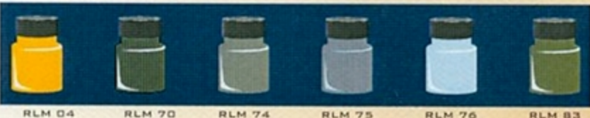
RLM 04 RLM 70 RLM 74 RLM 75 RLM 76 RLM 83

Bf 109 G-10.- Yellow 7, a rare a/c indeed. Fuselage seems to be camouflaged in RLM 83, 81 or a combination of these two low contrasting colors over RLM 76. Upper surfaces are not visible from our pictures while the lower wing surfaces seem to be largely unpainted except the ailerons and possibly the flaps. The cowling section was camouflaged in RLM 74/75/76, with a Black or RLM 70 ring around the front and spinner. JG 300 was based on Northern Germany and Poland at the end of the war, and this a/c may have been flown from Aining to Prague-Kbely only days before the end. The W.Nr. is unfortunately not visible with the exception of the last digit (6), and the latest research indicates this may have been an Erla built a/c. Do you want an unusual aircraft? Try this one for an answer !!