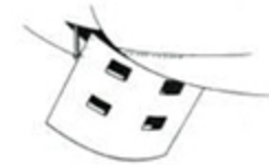
F-84E slotted speed brake

Note: Use the keyed dashes on the number decals for proper alignment and placement.