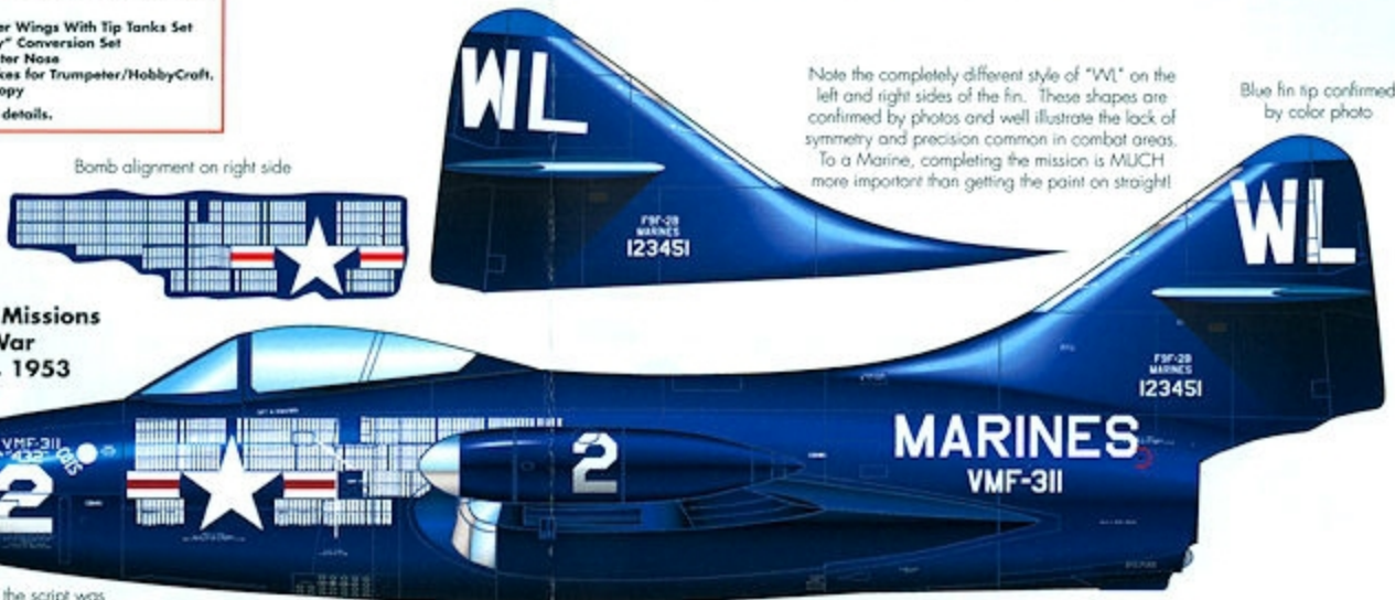
F9F-2B VMF-311 Most Panther Combat Missions During Korean War K-3 Pohang, Korea, 1953

Unknown whether the script was added to the right side nose number