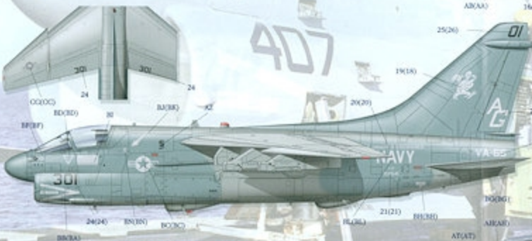
4. LTV A-7E 157566/AE414, VA-87 "Golden Warriors", USS Independence, Grenada, October 1983