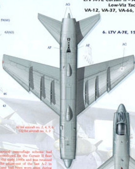
6. LTV A-7E, 159285/AC405, VA-72