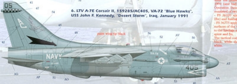
6. LTV A-7E Corsair II, 159285/AC405, VA-72 "Blue Hawks", USS John F. Kennedy, "Desert Storm", Iraq, January 1991

AJ for aircraft no. 2, 4, 5, 6 CJ for aircraft no. 1, 3